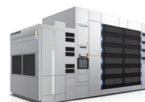
Coater/Developer CLEAN TRACK™ LITHIUS Pro™ Z