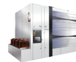
Single Wafer Cleaning System CELLESTA™ -i