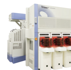
Single Wafer Deposition System Trias™