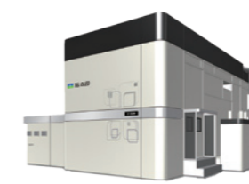
Inkjet Printing System for Manufacturing OLED Panels Elius™ 2500