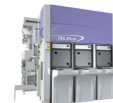
Plasma Etch System Tactras™