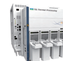
ALD System NT333™