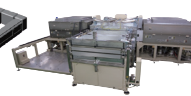
FPD Plasma Etch/Ash System Impressio™