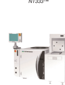
Wafer Prober Precio™ XL